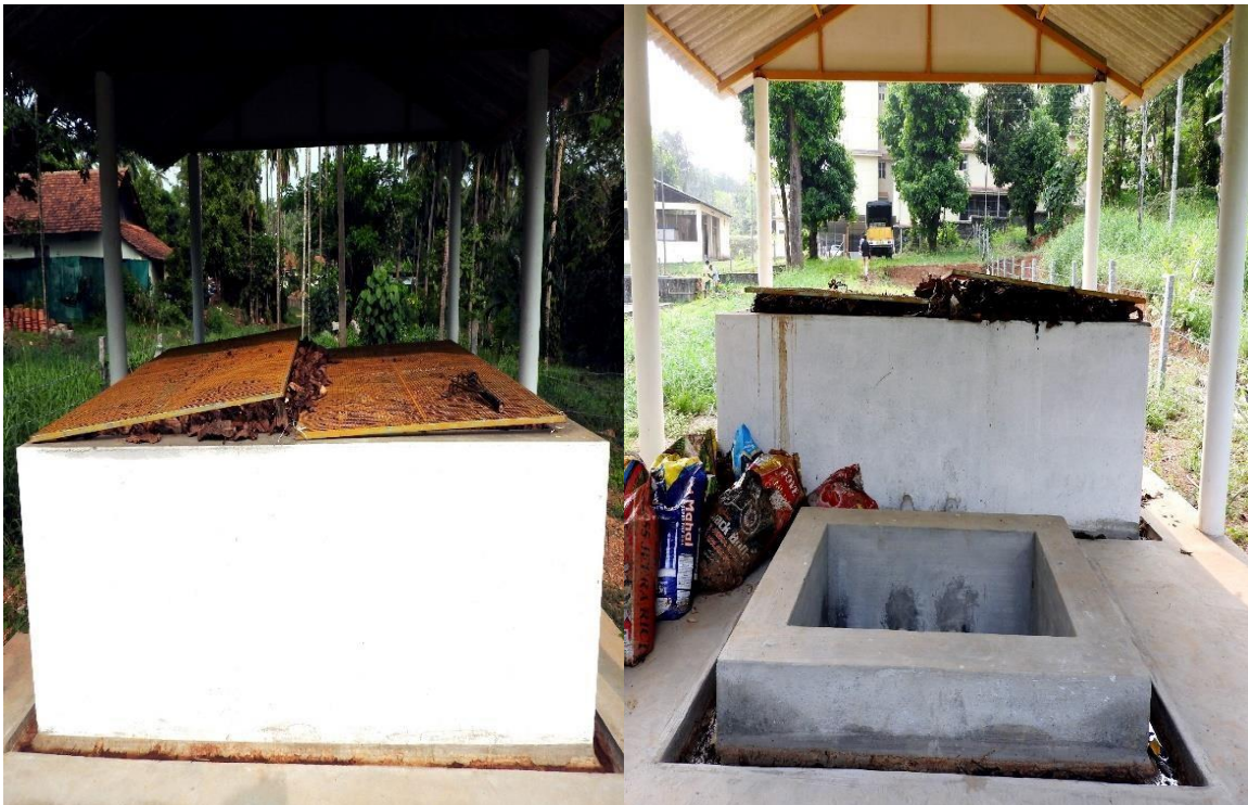
Vermi Compost Pit in WSP