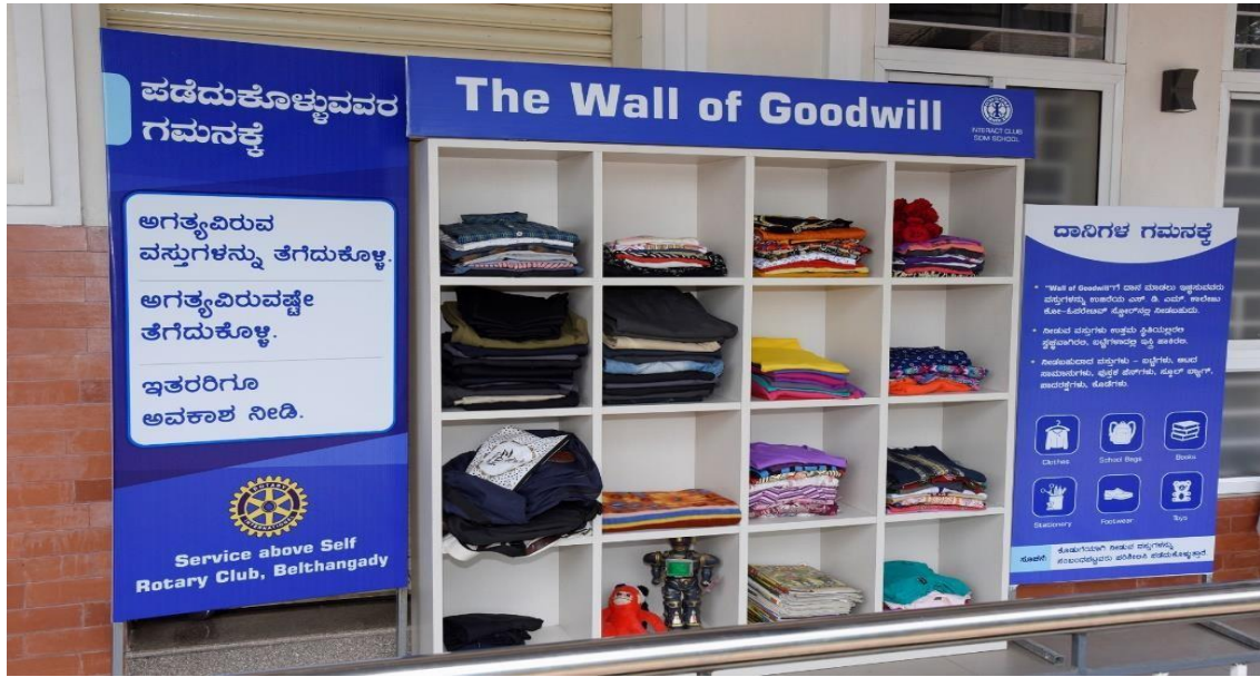
Display of Items in Wall of Goodwill