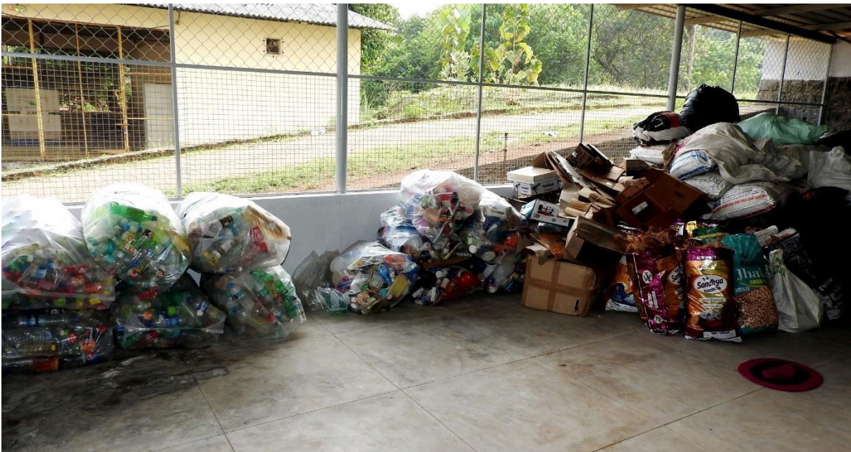
Disposal Ready Segregated Waste