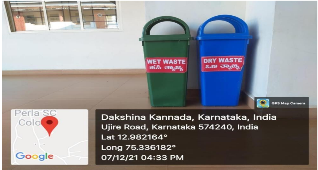
Green Bin for Wet Waste and Blue for Dry Waste