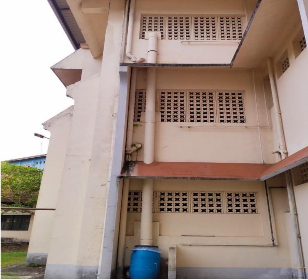
Sanitary Waste Collection Facility in Hostels