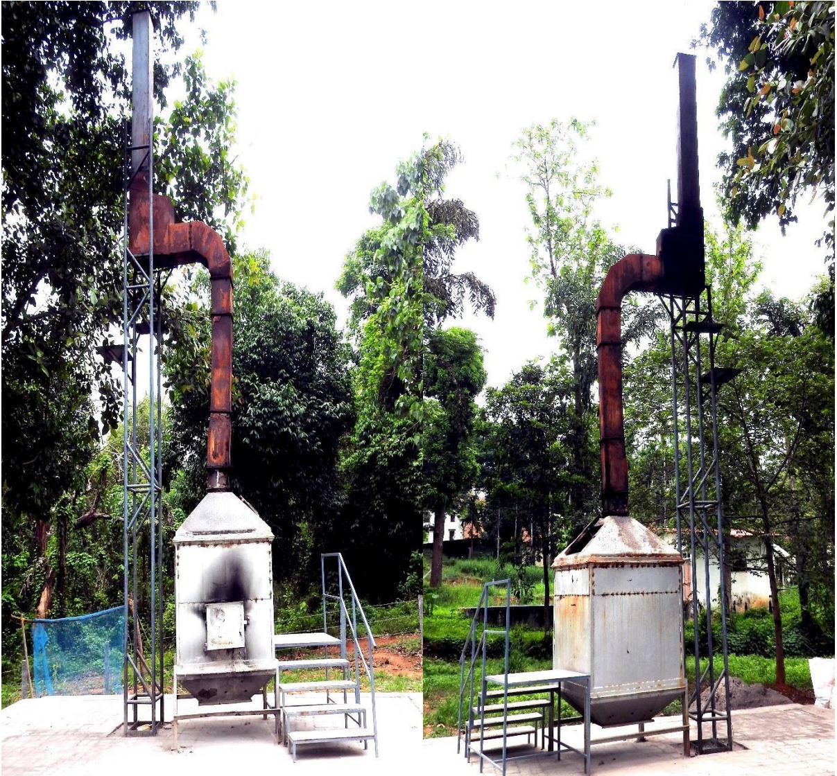
Incinerator designed and developed by the institution