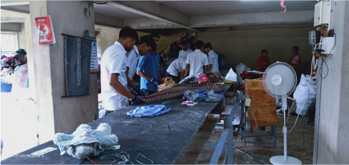
Students doing Used Cloth Segregation