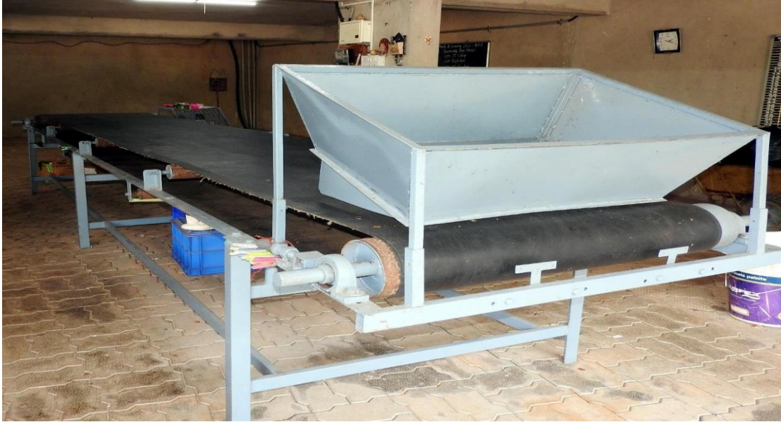
Conveyer Belt facility for segregation