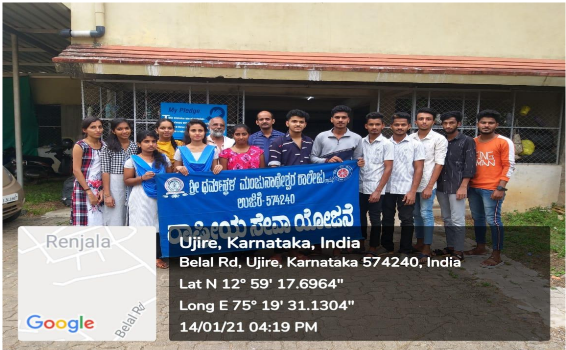
Students visit to Waste Segregation Unit